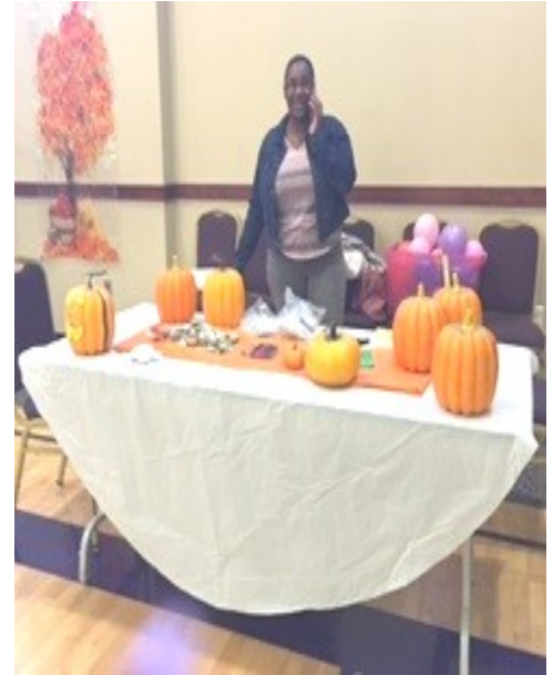
Pumpkin painting for children and adults. Food for all.