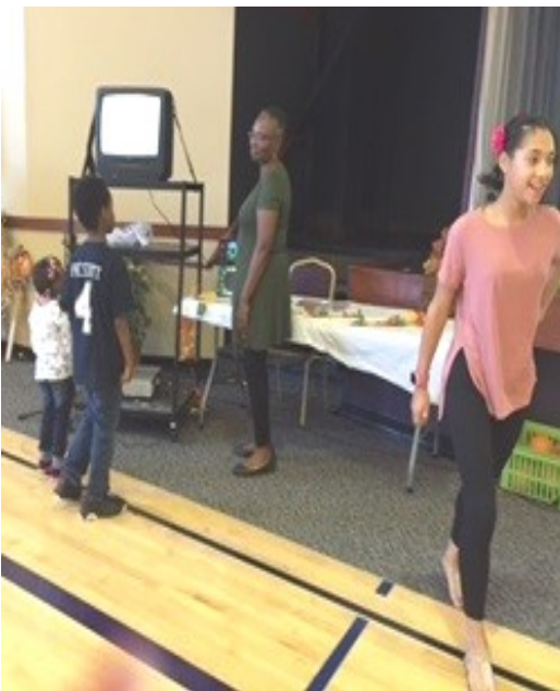
A scavenger hunt and karaoke for the youth and teens.